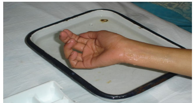
Fig. 1: Difficulty in opening hand on immersing in cold water

Detailed family history and pedigree charting revealed eight other persons in the family, including the father, were affected in an autosomal dominant inheritance pattern (fig 2). The youngest patient was 8 year old while the oldest was 65 year old. The other patients had less severe symptoms as compared to the proband. Patient's serum electrolytes were normal. Electromyography (EMG) revealed evidence of primary myotonic discharge consistent with the diagnosis of paramyotonia. Muscle biopsy was normal.